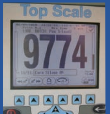
TopScale™ on Mixer Displays Ration Weights and Analysis