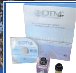
Set Ration Default Values - DTM Feed Management Software

Adjust for Dry Matter at the Batch Mixer in REAL TIME with the FeedScan™ dg precisionFEEDING™ system.